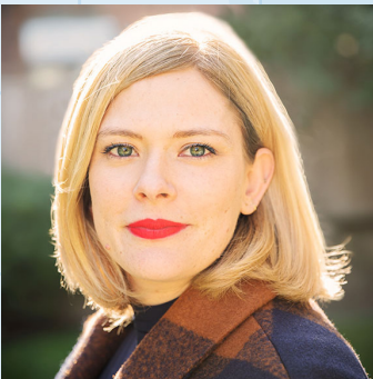
SUSANNAH CAHALAN BEST-SELLING AUTHOR OF BRAIN ON FIRE AND THE GREAT PRETENDER

colonies on the moon and Mars, how close we are to answering the question of whether there is intelligent life beyond planet earth, and what do these endeavors say about our basic values.